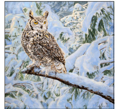
Weather Wise 14" X 14" $2400.