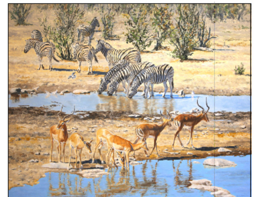
Don't Drink Alone 27" X 34" 12,500.