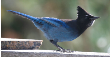
Steller's Jay

The weather in Spokane was just right to make some of the best fall colors we have seen in years. Our sunflower seed feeder and suet hanger, which are usually a hub for smaller birds, have seized the attention of some larger visitors. Steller's jays, northern flickers, and magpies have joined the crowd! Fortunately, the nuthatches, chickadees, and finches are not bothered by the antics of the larger birds grabbing a snack from feeders not designed for their size.