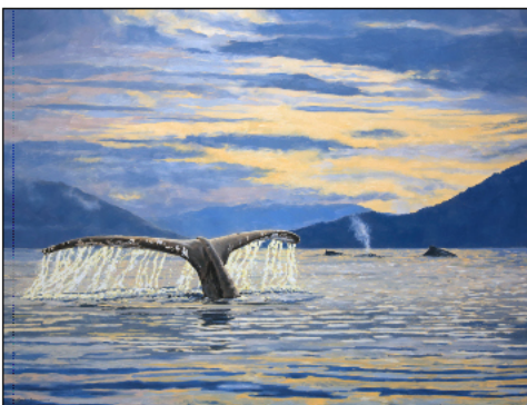
Tail As Old As Time 17" X 24" $4500.