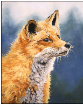
Curious 10" X 8" $1150.

Linda's painting Morning on the Marsh was selected for the banner and advertising for the Artists For Conservation Tour Show. See below